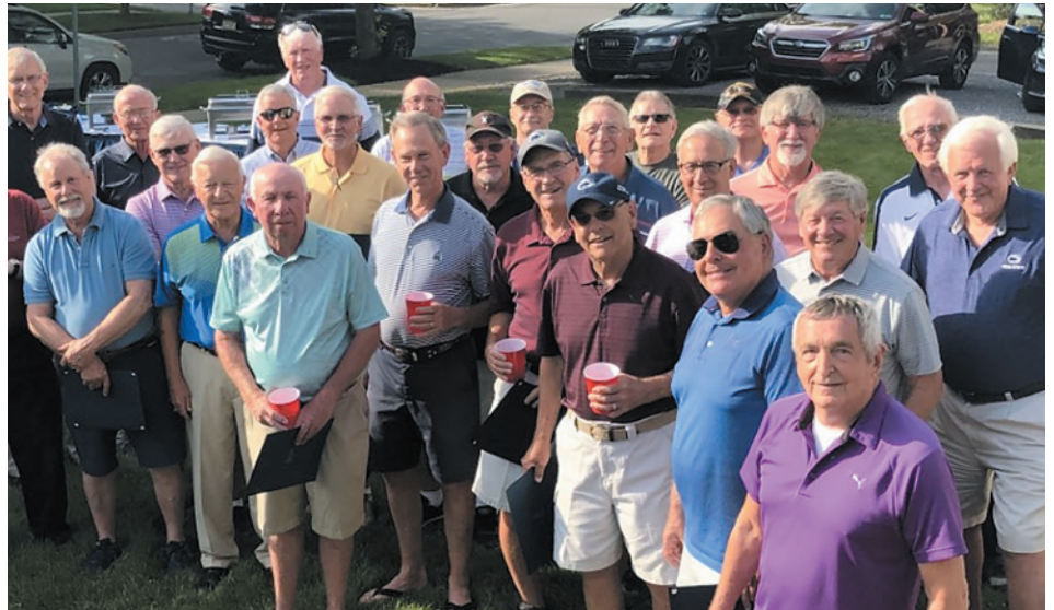
Alpha Chi recognized brothers who have been Brothers for more than 50 years. Each Brother got a Pin and a Certificate.

Sigma Chi is a lifelong obligation and our alumni continue to show up for our events, including our 30 th annual Alumni Weekend coming in June 5 th -7 th 2020. Our Chapter thrives when Alumni spend time with them and we are looking for more Alumni (young and old) to interact with our Chapter. Finally, we can't operate without donations and any amount you can give is sincerely appreciated.