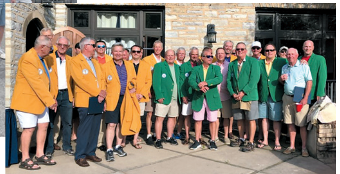
Alpha Chi started a new tradition with the AX Hall of Fame, recognizing alumni who have served for more than 10 years as an Advisor or HC Board Member. The Golf Committee was also recognized for their service over 29 years.