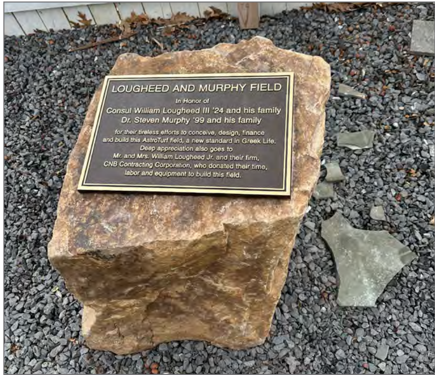
New plaque in the dedicated side yard