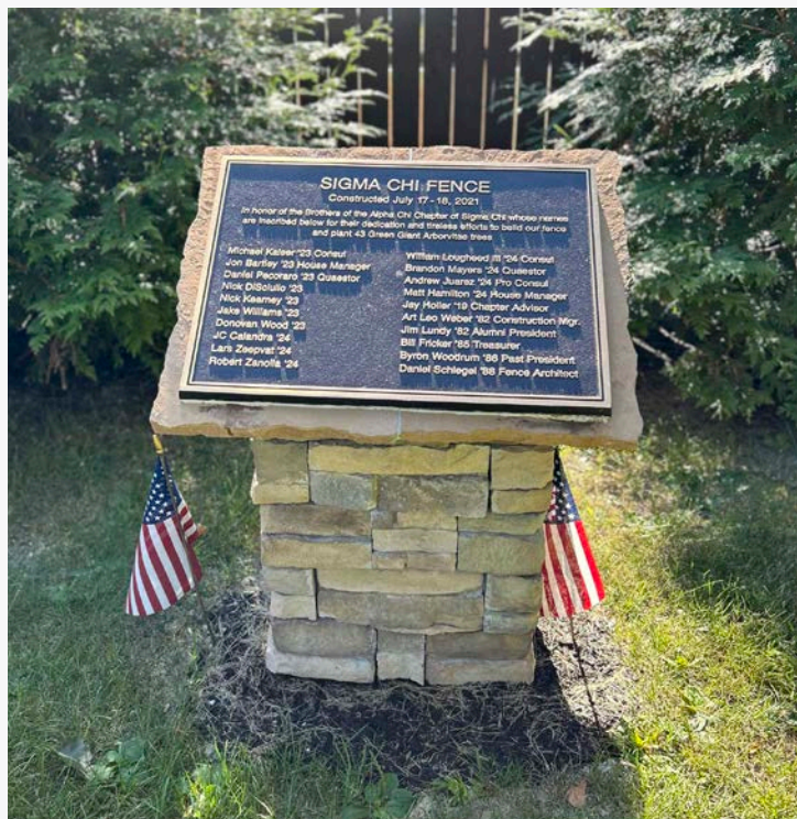
The finished memorial pedestal, which honors the hard work of 20 Alpha Chis that made the side yard fence project a success.

Four summers ago, in July 2021, the first steps in creating our great side yard venue began. That included installing the perimeter stockade fence and surrounding that fence on the public side with a total of 43 Green Giant arborvitae trees. Twenty undergrads and alumni participated in that effort. While you have no doubt seen numerous articles about the use of the fenced-in area over the last four years, we were remiss in not paying honor to those who got this project out of the mud. A photo of the finished memorial pedestal is included. The brass plaque was ready a year ago, but the weatherman had other plans, and we had to delay the masonry component until this spring.