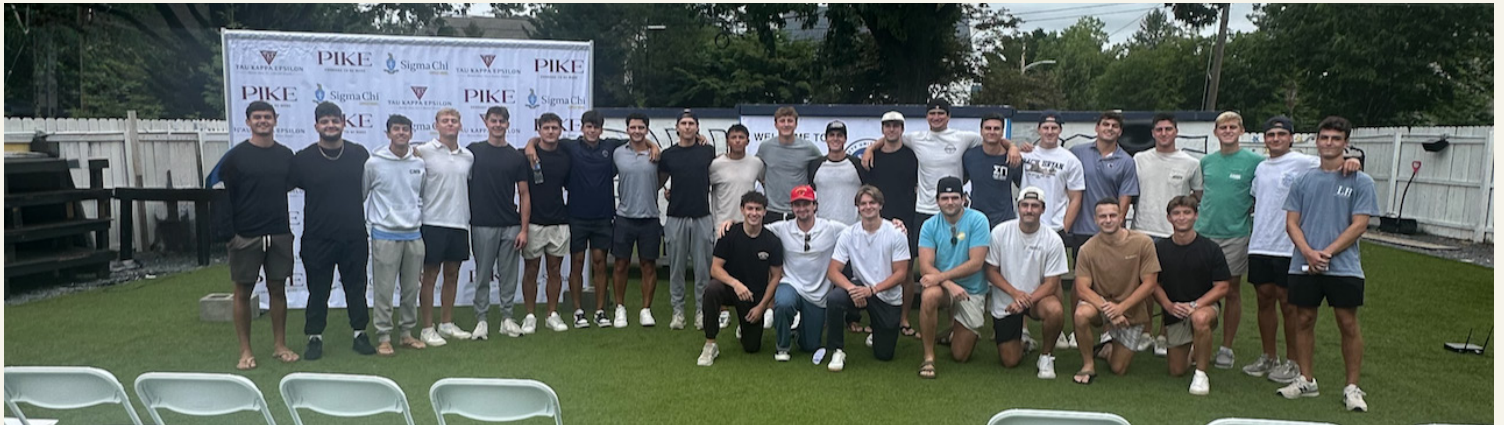
Brothers posed for a group photo at the SCIFC retreat.